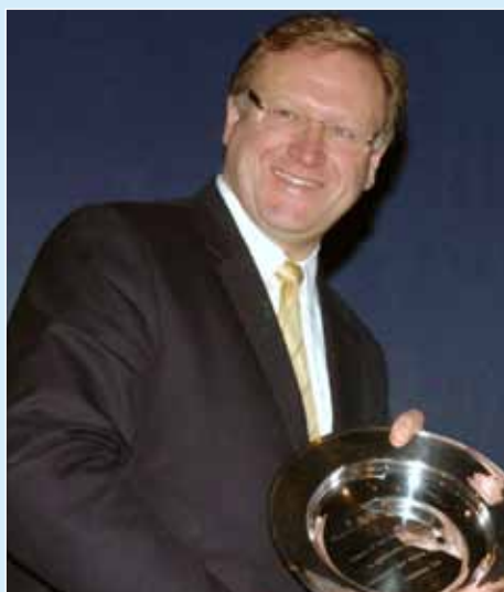
The Mayor of Stavanger with the commemorative plate presented by Sail Training International during the Gala Dinner.

thanked the city mayor and the city organising team for hosting such a wonderful 2010 International conference and for contributing to its major success. He went on to thank the 50+ speakers and facilitators, as well as the Sail Training International staff team for their part in staging the most successful international conference yet.